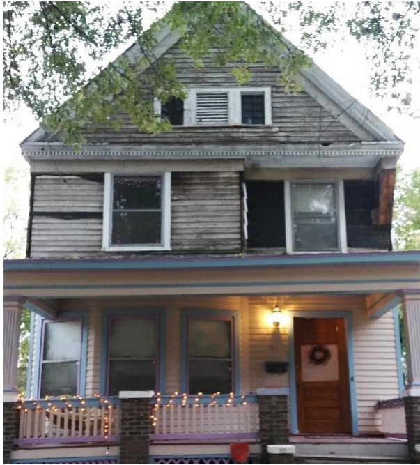
PROJECT EXAMPLE: BEFORE