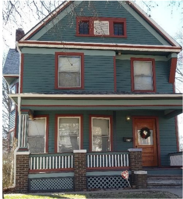
PROJECT EXAMPLE: AFTER