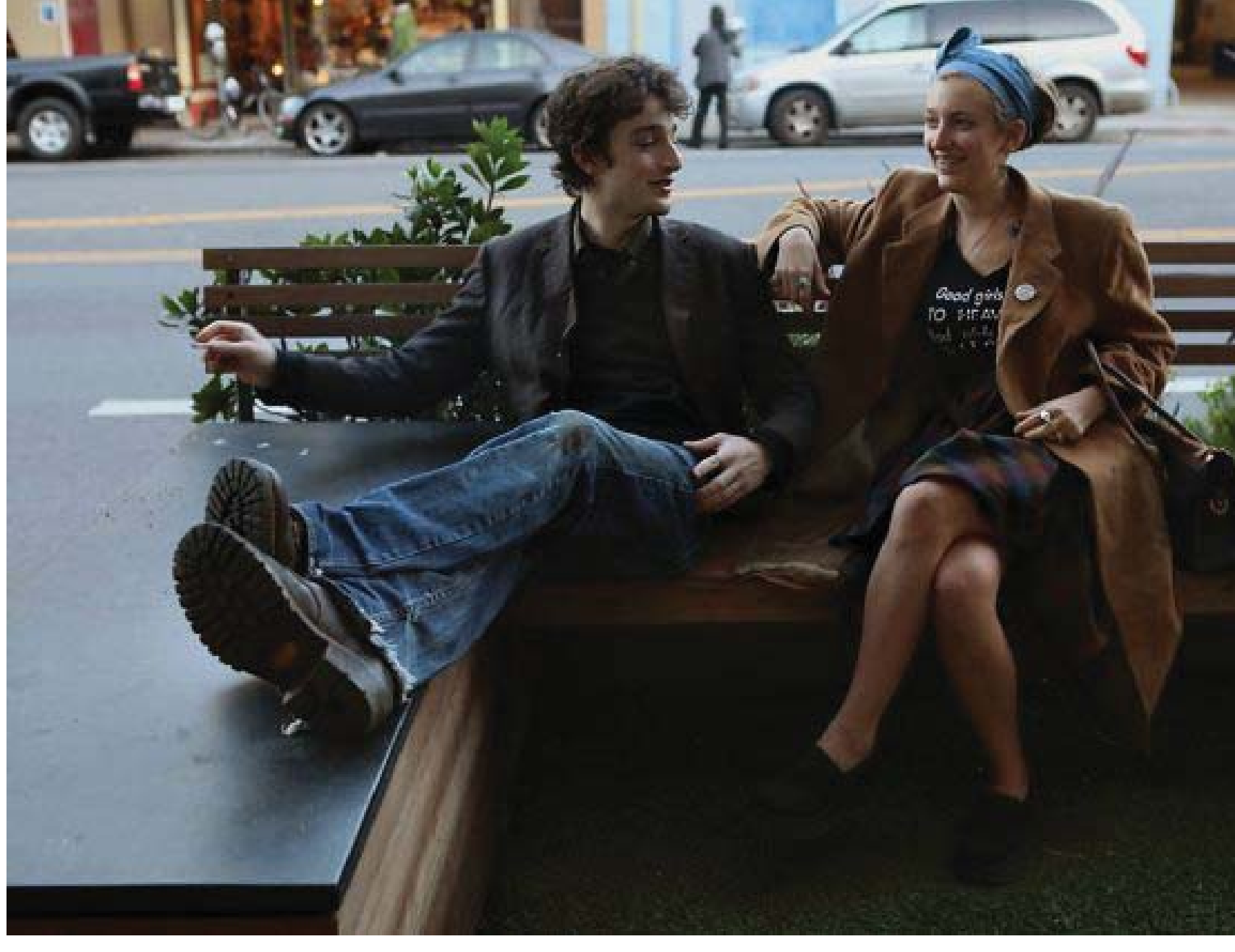
Places to Play