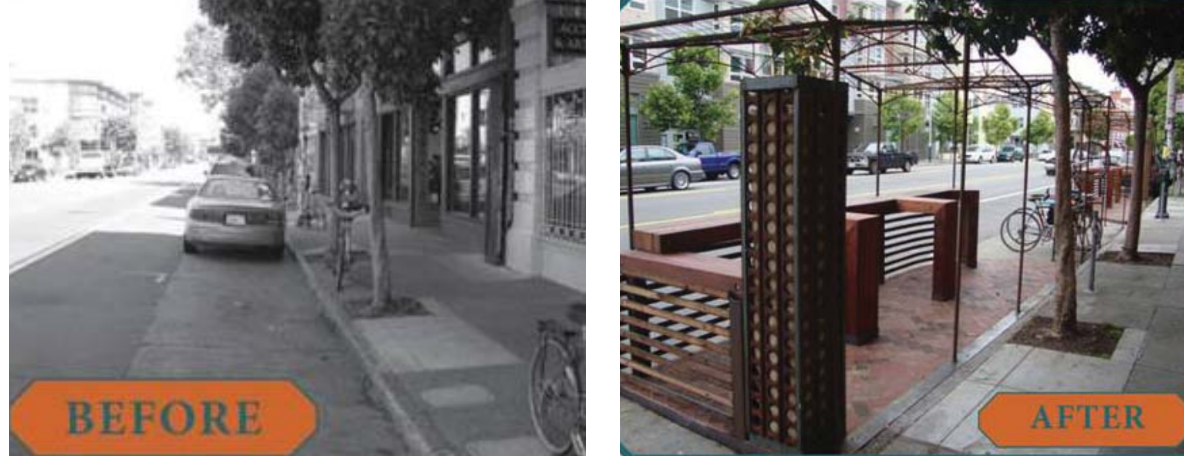
Places to Connect

"Parklets" are temporary platforms adjacent to sidewalks, usually within existing parking lanes. Expanding the sidewalks creates a seasonal space for outdoor seating and dining. The concept is used as a place making tool, contributing to an increase in pedestrian volumes and promoting economic development in retail corridors and downtown's around the country.