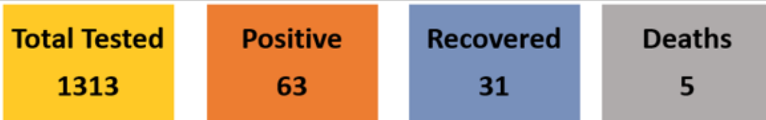
Sangamon County COVID-19 Confirmed Cases